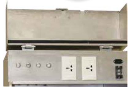
Stainless Cover & Independent Switches

Wherever You Are, The Light Tank® Is On Your Side!