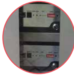
Capacity Status Window