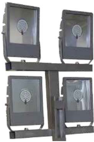
Multi-Angle Adjustable *Power Tank® (Not included)