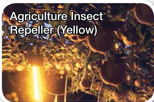
Agriculture Insect Repeller (Yellow)