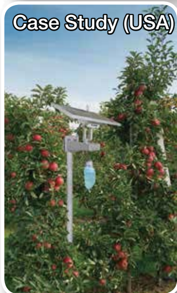
Case Study (USA)

Remarks : Insect Repeller / Catcher Kit Not Included