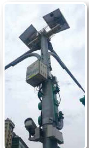
TCPD Case Study