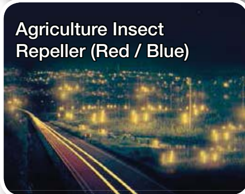
Agriculture Insect Repeller (Red / Blue)