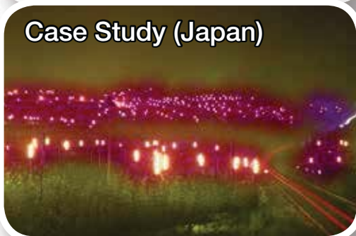
Case Study (Japan)